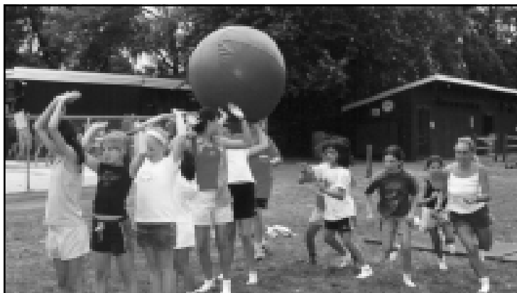
Campers having a ball at Ramah Day Camp in Wheeling.

off at school. Ramah campers can be heard in their religious school and day school classes, sharing knowledge and ideas they report having learned at camp.